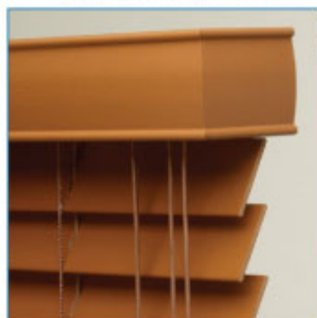
Federation Design Fascia