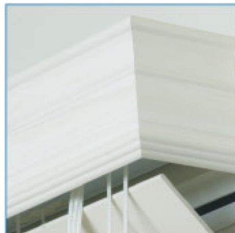
Colonial Design Fascia

CARE INSTRUCTIONS: Dust regularly with a soft cloth or duster. The slats can be wiped over with a damp soft cloth dipped in mild detergent and warm water solution.